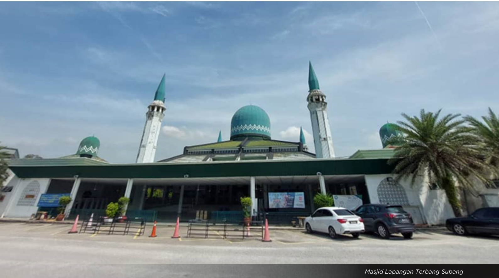
Masjid Lapangan Terbang Subang