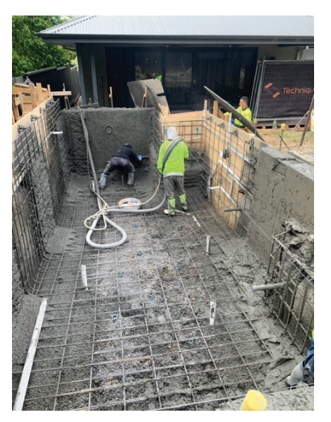
The process of installing an in-floor pool cleaning system with Waterco is easy — simply send in your plans and Waterco will work out the layout of the jets and the drain.

"My requirements were a competent in-floor system that suited the heavily treed area," Glover explains. "This pool also has a spillway tank that required a separate circulation system. Darrin suggested suitable pumps — Waterco's <a href="https://doi.org/10.1016/jwp.com/">Hydrostorm ECO-V</a> variable 1.5hp for the filtration, Hydrostorm 1.5hp for the in-floor and a <a href="https://doi.org/">Supatuf ECO</a> 1.0hp for the spillway — to achieve the desired result."