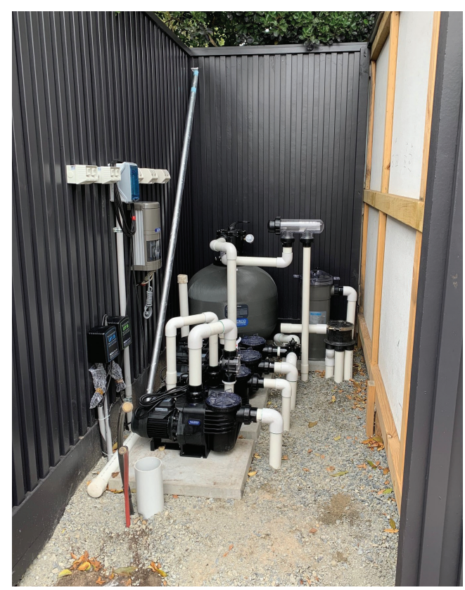
Waterco's <u>Hydrostorm ECO-V</u> variable 1.5hp for the filtration, Hydrostorm 1.5hp for the in-floor and a <u>Supatuf ECO</u> 1.0hp for the spillway.