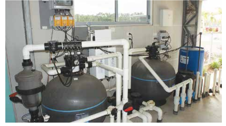
The Hydroxypure system continually sanitises your swimming pool by testing the water and automatically maintaining optimum levels of residual sanitiser.

Accurate Group is an Industrial/ Commercial/domestic building company with a plumbing section, steel fabrication section and an earthmoving section.