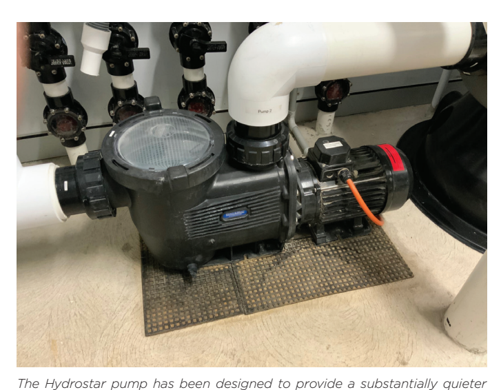
operation with even higher flow rates and higher head than previous models.

Purpose-built for commercial pools, aquatic facilities and aquatic parks, Waterco's new Hydrostar pumps operate with lower noise levels and improved hydraulic efficiency. The pump body does not rust or corrode and is able to withstand damage from many types of water treatment chemicals. Waterco's commercial thermoplastic pumps weigh less than their steel counterparts without any sacrifice in strength and durability.