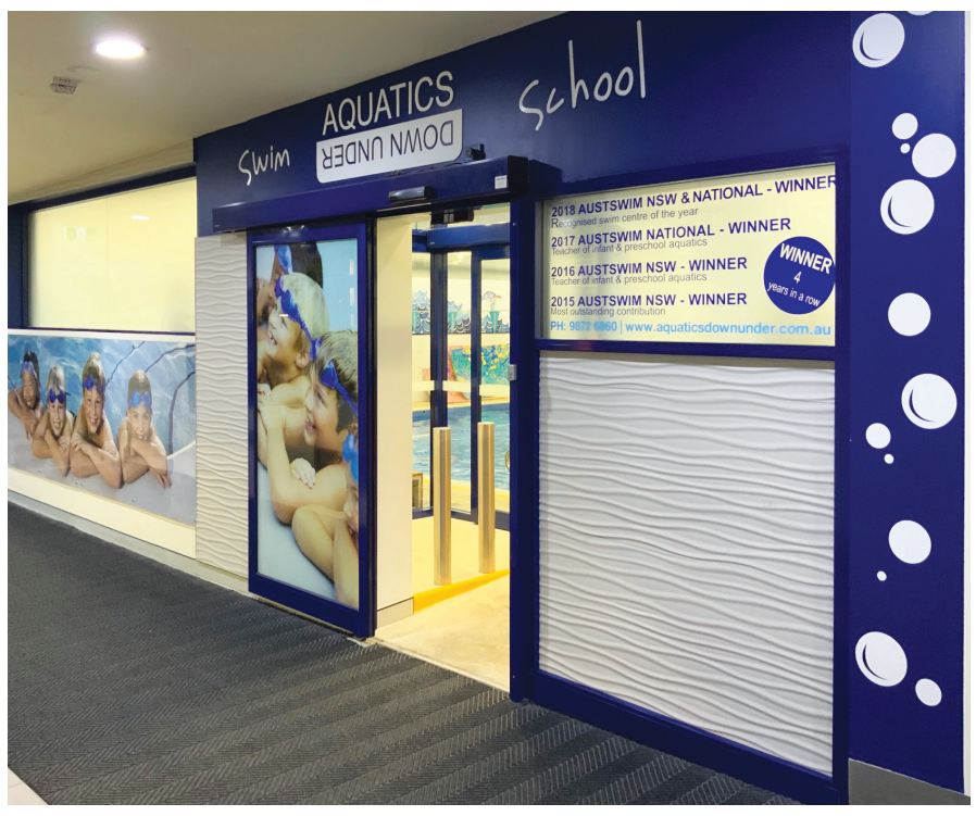
In 2018, Aquatics Down Under received the prestigious NSW and National Swim centre of the year