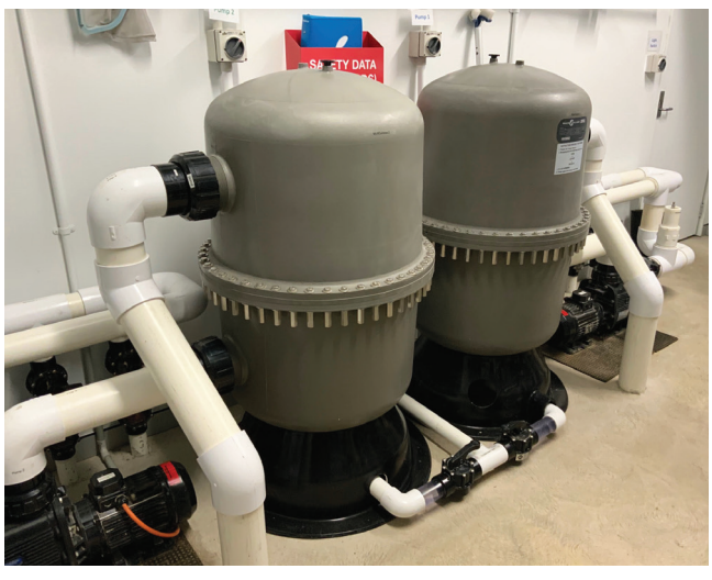
MultiCyclone 70XL is a brilliant pre-filtration device that works on the basis of centrifugal water filtration and is designed with no moving parts and no filter media to clean or replace.