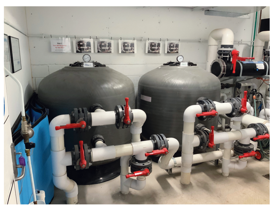
Micron vertical commercial filters are equipped with "Fish tail" hydraulically balanced laterals, to improve its filtration and backwashing hydraulic efficiency.