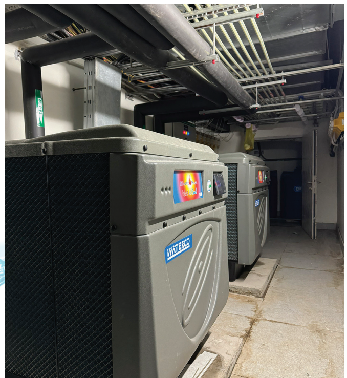
Advanced filtration meets efficient heating: Waterco’s Micron FRP Filters and Electroheat Plus Heat Pumps