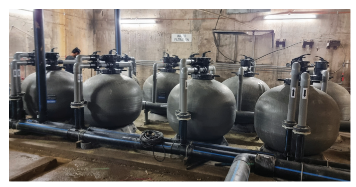
Waterco Micron Fibreglass Filters setup at Sunway Resort Hotel