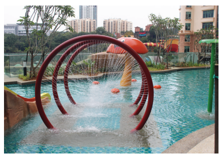
Waterventure for Kids (@Level 5