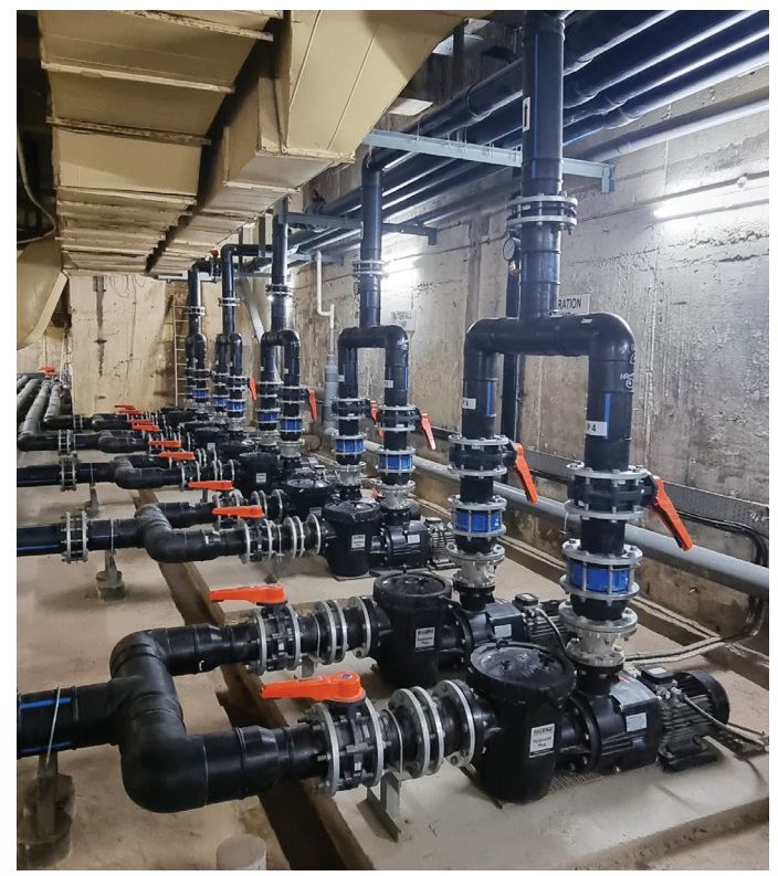
Waterco Series of High-Performance Pumps installed at Sunway Resort Hotel