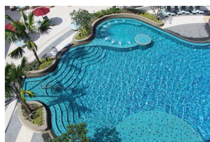
Freeform Landscaped Swimming Pool for All (@ | evel 1)