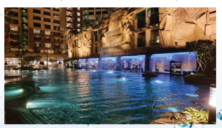
Night view with crystal clear pool